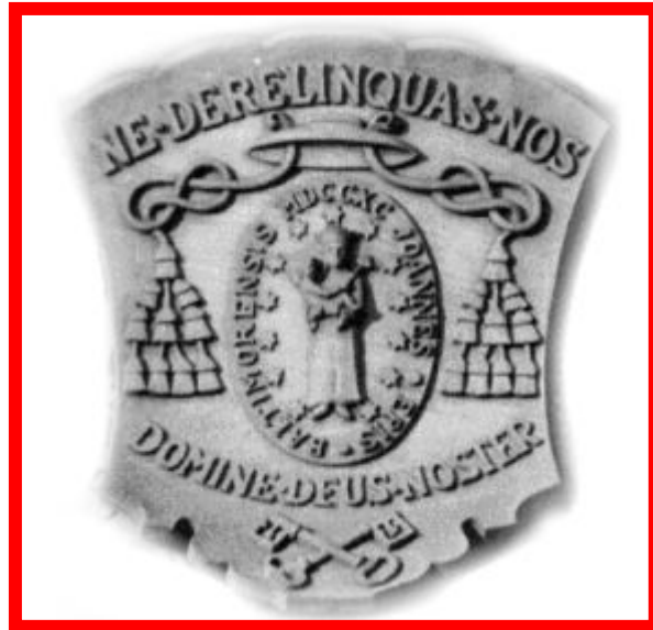
Seal of Bishop Carroll